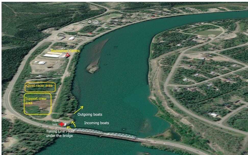
Figure 2. Approaching the Bridge Site Checkpoint CP3 (B)