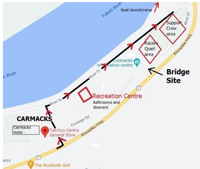
Figure 3. Arriving in Carmacks

Location: Approximately 2 hours from Whitehorse on the North Klondike Hwy. Once in Carmacks, turn left onto Freegold Rd. just past the Tatchun Centre General Store. At the T intersection, turn right and proceed past the Recreation Centre for 300 m to the Bridge Site Checkpoint CP3 (B).