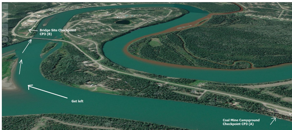
Figure 1. Coal Mine Campground to the Bridge Site

Note: Carmacks checkpoints subject to change based on water levels